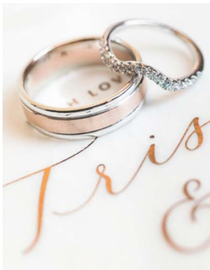
Clockwise from left to right: Rings from a wedding ceremony. A white wedding cake complete with flowers from Cream & Sedona Cake Couture bakery. A bouquet designed by Bliss Extraordinary Floral.