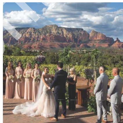
Clockwise from left to right: A ceremony set up complete with white chairs and flower petals on the aisle for a wedding at Amara Resort and Spa. A groom dips his bride at an outdoor ceremony at the Agave of Sedona Wedding & Event Center. A couple exchanges vows outdoors with a red rock backdrop at Agave.