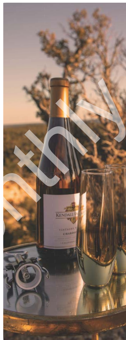
Clockwise from left to right: A couple embraces on Lipan Point in Grand Canyon National Park with expansive views in the background. A bottle of wine and glasses for a post-ceremony celebration at Lipan Point.

views, aspen groves and expansive wildflowers fields.