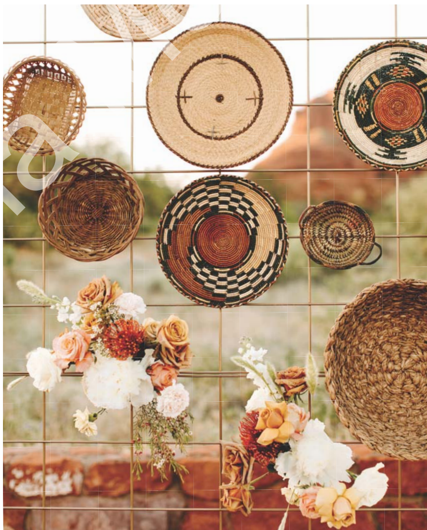
Clockwise from left to right: A bride stands outside of West Sedona's Enchantment Resort with a red rock backdrop. Colorful Southwest decor at a wedding at the Red Agave Resort in the Village of Oak Creek.